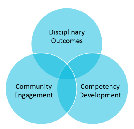
Figure 1. A Pedagogical Model for Increasing Impact through Community Engagement

The University of Toronto's teaching mission outlines the institution's goal to "strive to ensure that its graduates are educated in the broadest sense of the term, with the ability to think clearly, judge objectively, and contribute constructively to society." In line with this, we might consider higher education curricula more broadly, as they relate to learning through experience, as the deliberate integration of disciplinary outcomes with community engagement and competency development. In this model, the integration of disciplinary outcomes with some form of community engagement becomes the expectation. This is not a new concept, and many examples of this integration are already practiced across the University at both the undergraduate and graduate levels. The intention is that through this approach to designing higher education curricula, this integration may be more clearly articulated. As well, through the deliberate augmentation of students' integration of disciplinary outcomes with community engagement and competency development, the student learning experience and the impact of students and the University in supporting greater community and societal needs would be collectively enhanced.