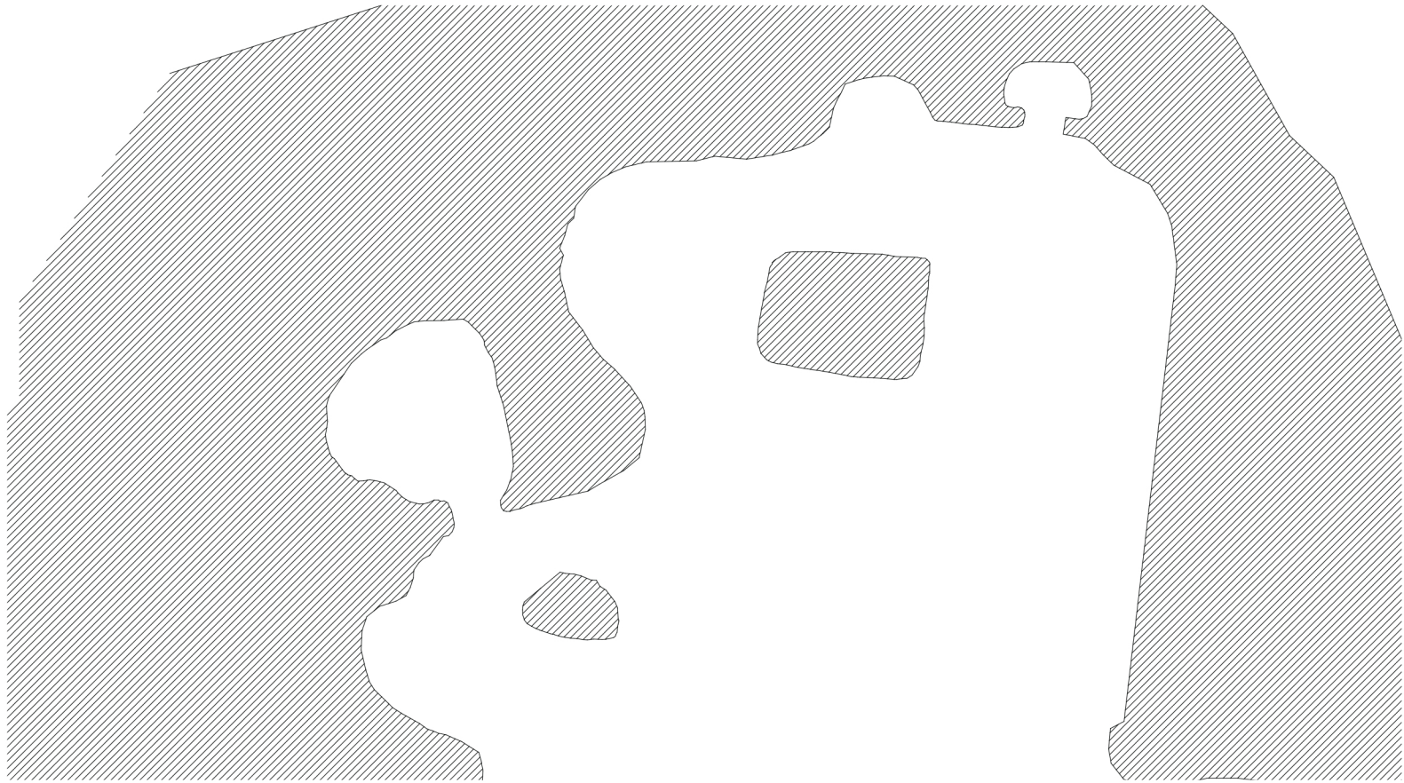
Spatial Layout of the chamber, Excavated