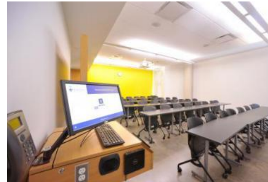
Teaching Station Junior

We train instructors on using Teaching Stations and provide instant support over-the-phone and in-person